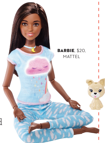
BARBIE, $20. MATTEL

SOURCE: Study published in Psychology Research and Behavior Management , April 2018.