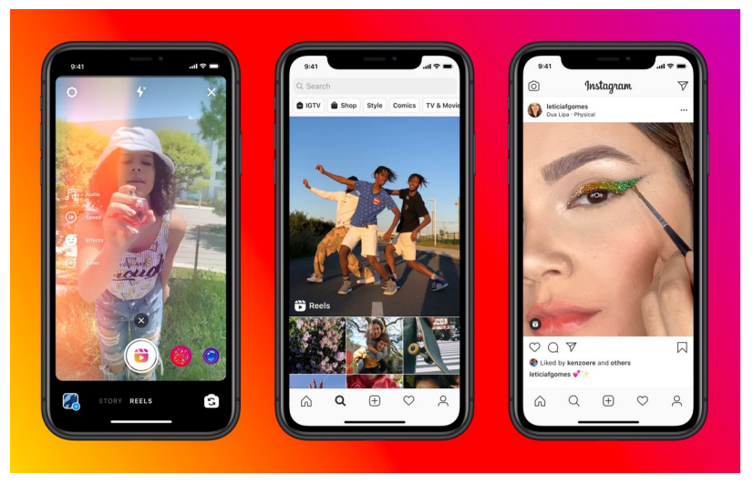
Reels, a new service within Instagram that Facebook plans to launch in the U.S. soon, has offered lucrative incentives to popular TikTok creators for them to join.

What you get is a stream of entertainment that's hard to put down. And even as <u>some</u> <u>politics and social issues</u> have started to creep in it's often presented in a lighter, community-minded manner by younger creators.